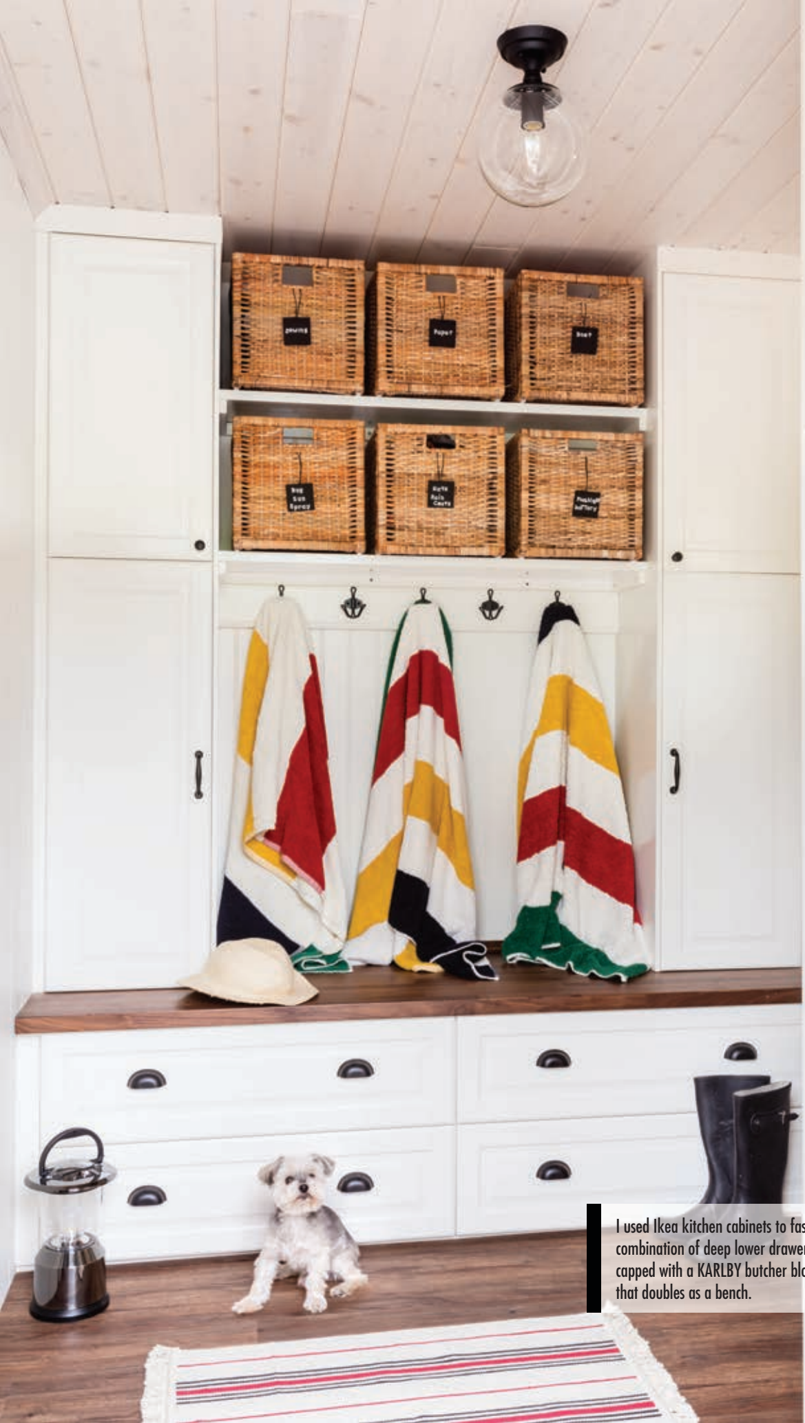
MUDROOM • AFTER

We moved the laundry elsewhere, which allowed us to create a charming little mudroom.