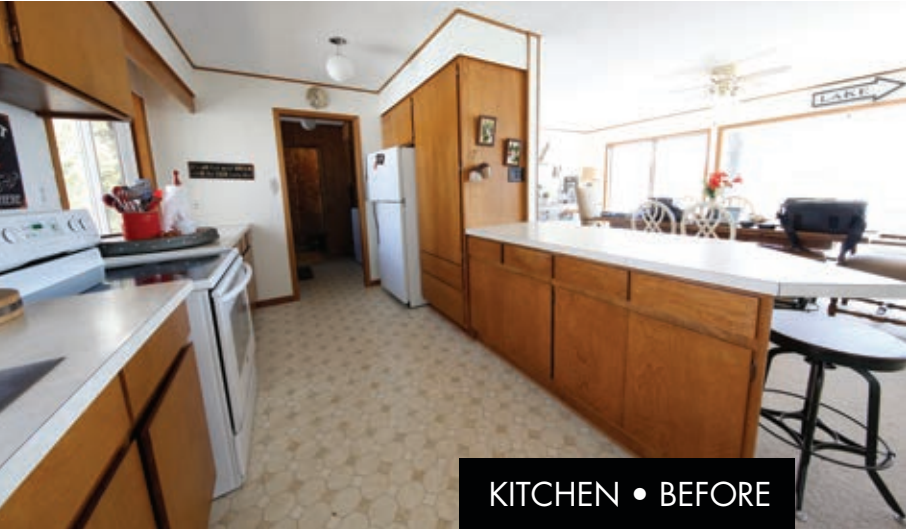
KITCHEN • BEFORE