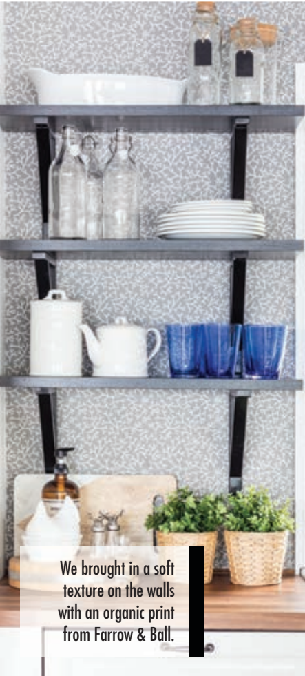
We brought in a soft texture on the walls with an organic print from Farrow & Ball.