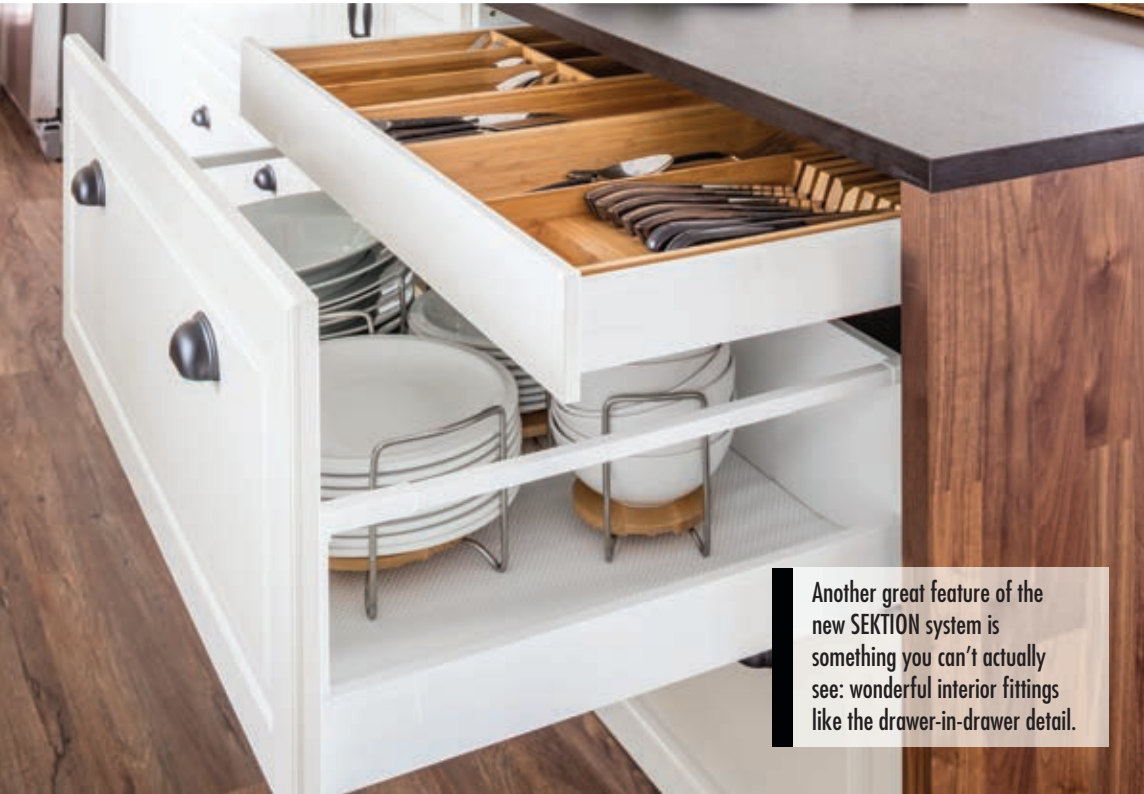
Another great feature of the new SEKTION system is something you can't actually see: wonderful interior fittings like the drawer-in-drawer detail.