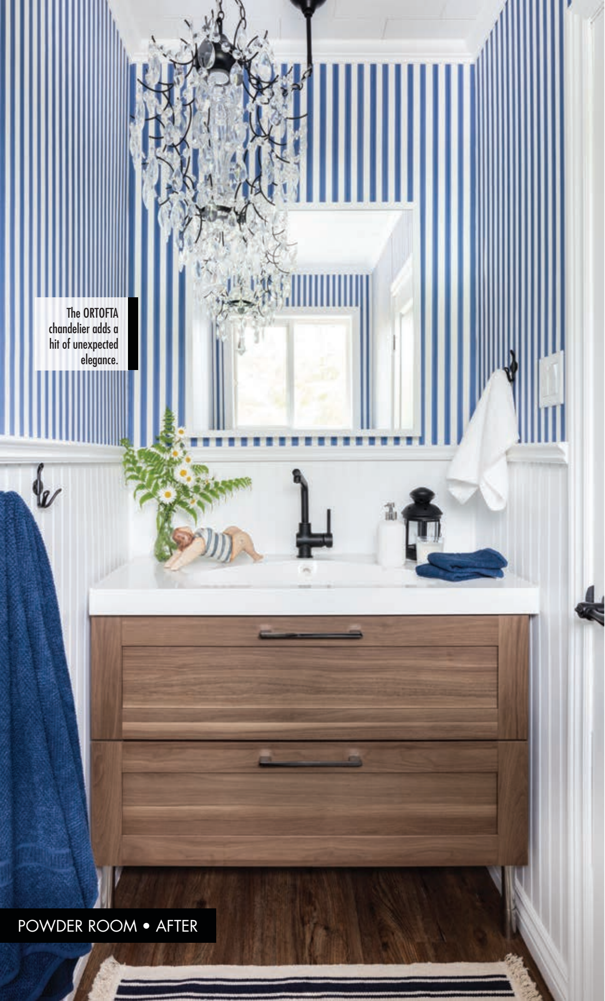
The ORTOFTA chandelier adds a hit of unexpected elegance.