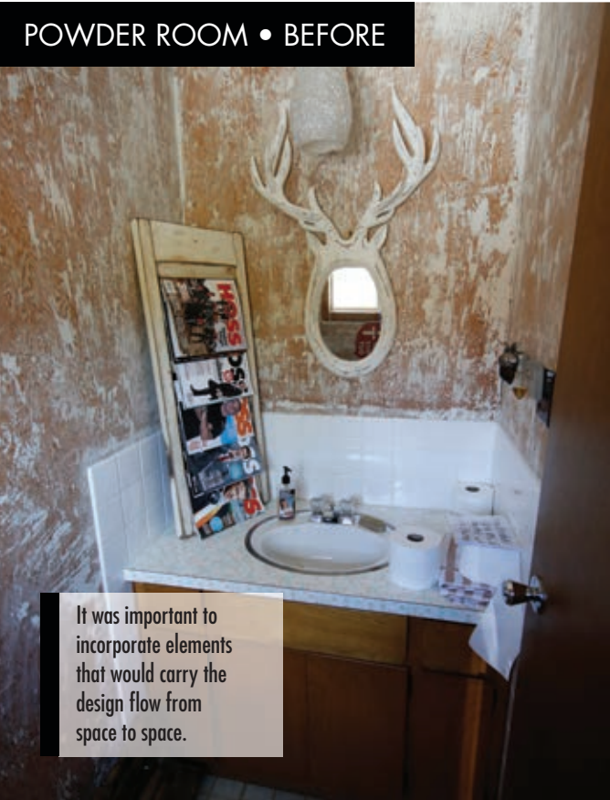
It was important to incorporate elements that would carry the design flow from space to space.

Throughout the cottage we installed a hardwearing LVT or luxury vinyl tile, the perfect choice for beach feet and impromptu dance parties. The medium-brown tone is echoed throughout in the butcher block and in the washroom vanities where I opted for the Ikea walnut GODMORGON sink cabinet. The finishing touch is the Closet Stripe wallpaper from Farrow & Ball in a watery blue and white stripe.