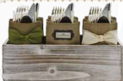
Cutlery Couture, www.cutlerycouture.com

Hey Santa! I would love to get these chic, cutlery holders to use during a dinner party! I love the rustic look of the burlap paired with the barn board display unit.