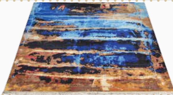
WSTUDIO Decorative Carpets, www.wstudio.ca

Hi Big Fella, The top of my wish list this year is a beautiful silk rug that I've been coveting. Every time I go and source a rug for my clients, I think I ought to treat myself!