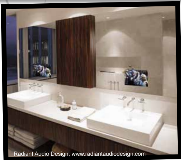
Radiant Audio Design, www.radiantaudio.com

As the year comes to an end, we anxiously await to see what’s in store in design for 2016. We’ve asked Canadian designers to help us predict what will be trendy in the new year.